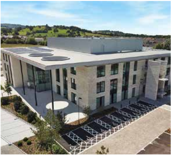
Ecclesiastical's office in Gloucester

As one of the UK's leading funeral plan providers and part of the Benefact Group, Ecclesiastical Planning Services works with funeral directors across the country, providing a safe home for your funeral plan pre-payment funds. The specialist UK-based financial services group of which Ecclesiastical Planning Services is part, has been protecting people, property and funds since 1887 and offering funeral plans since 2006.