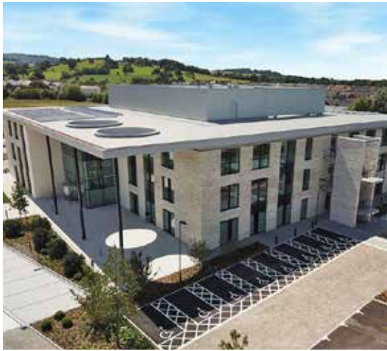
Ecclesiastical's office in Gloucester

Ecclesiastical Planning Services works with funeral directors across the country. It is part of the Benefact Group which is a family of award-winning, specialist financial services businesses that, from its profits, gives to good causes in order to transform lives and communities.