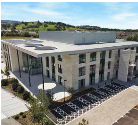
Ecclesiastical's office in Gloucester

Ecclesiastical Planning Services works with funeral directors across the country. It is part of the Benefact Group which is a family of award-winning, specialist financial services businesses that, from its profits, gives to good causes in order to transform lives and communities.